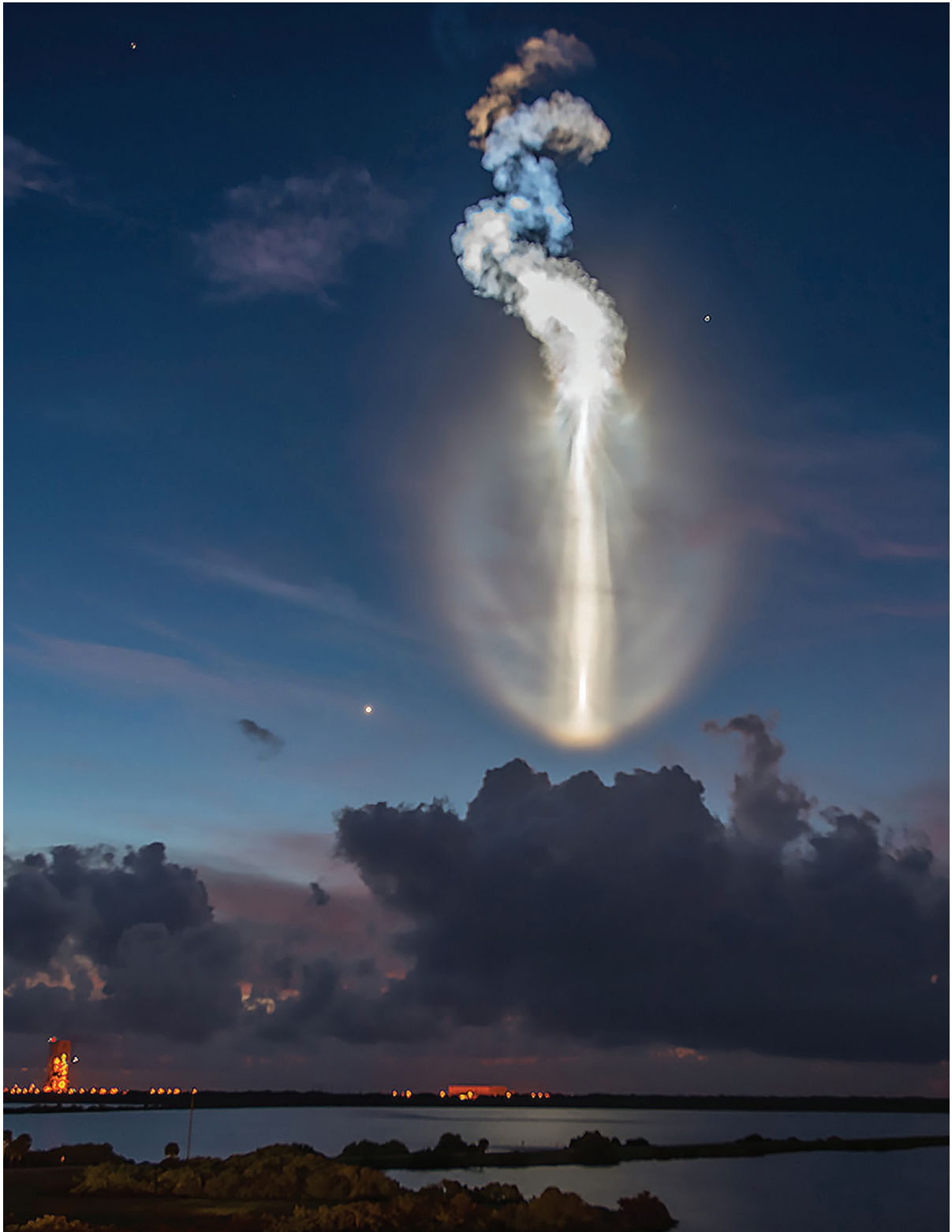
Above: An Atlas V rocket carrying the fourth Mobile User Objective System (MUOS) satellite launches from Cape Canaveral Air Force Station, Florida on September 2, 2015.