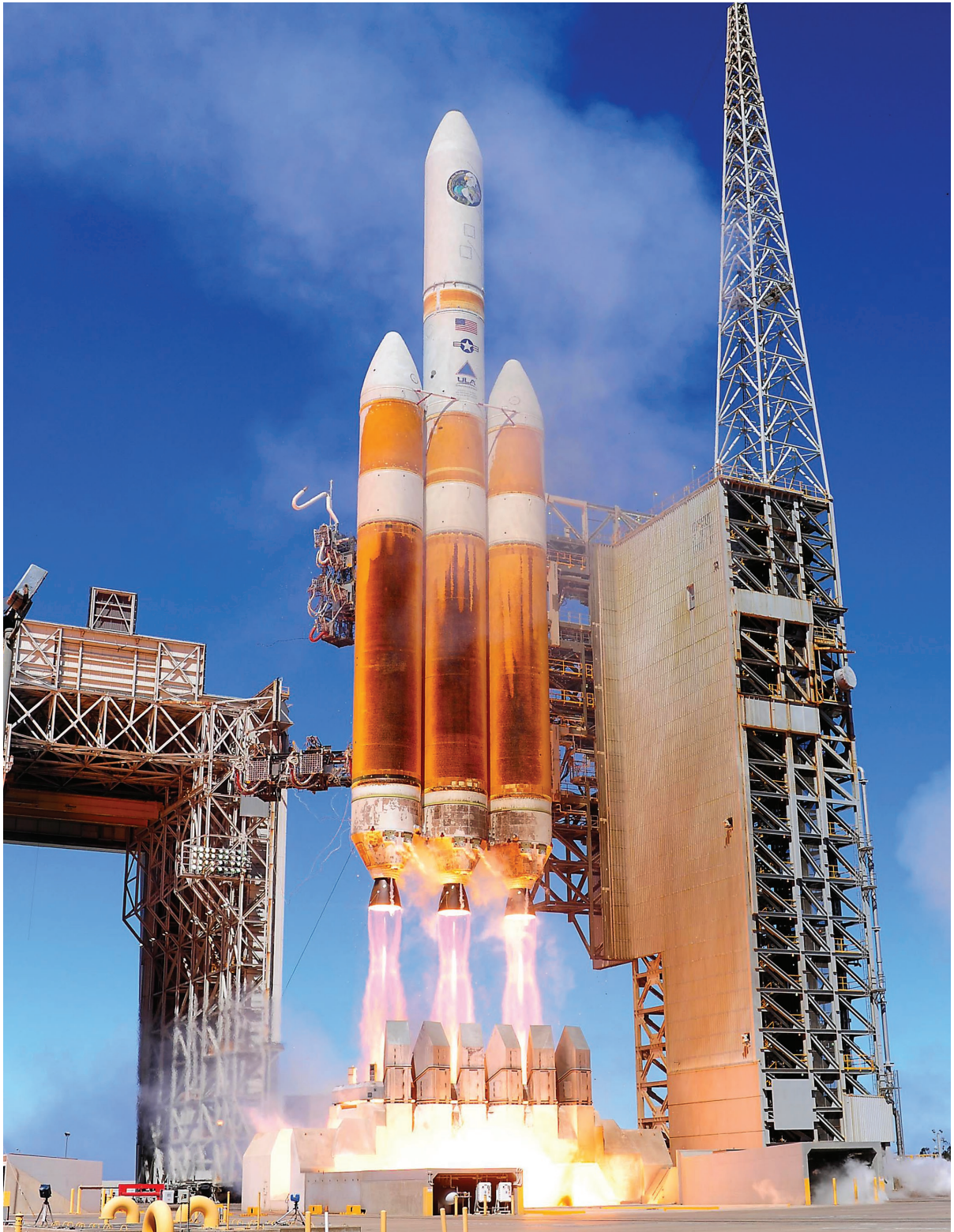
Above: A United Launch Alliance Delta IV-Heavy rocket carries a classified payload for the Intelligence Community aboard on its liftoff August 28, 2013 from Vandenberg AFB, California.