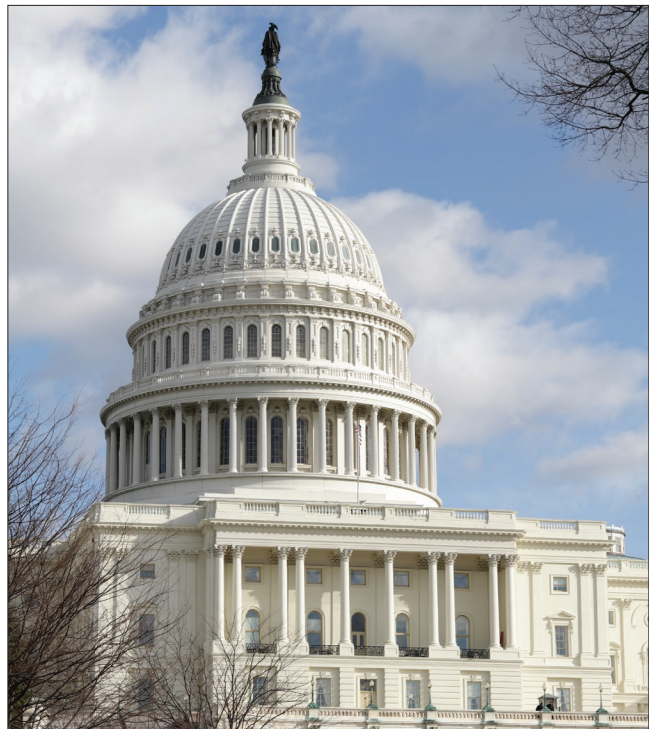
Above: The US Capitol. Many experts believe the current US regulatory approach to space is working well enough that it should be the foundation for any successor regime. Any additional regulations should be vetted by stakeholders and space constituencies, and work towards enhancing the safety of space operations, and facilitating the development of norms, standards, guidelines, and best practices.

Our respondents voiced little support for permissionless authorization and minimal continuous supervision for operations in an